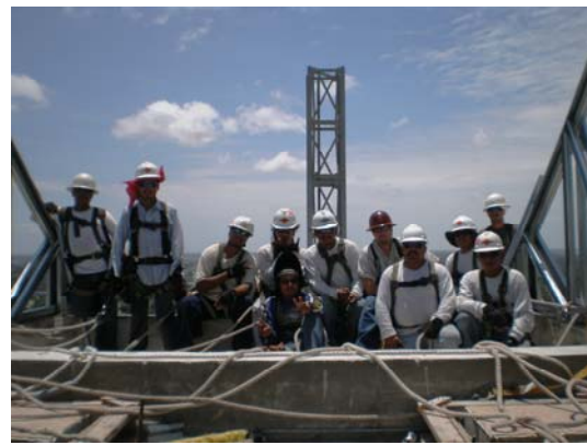
Working on the High Point Project

Crowther Roofing is an experienced fabricator and installer of light-gauge steel roof trussing systems. The use of steel trusses in commercial building projects has increased throughout the building industry, and Crowther Roofing has become an industry leader in this sector.