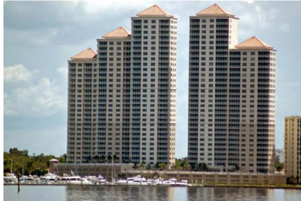
High Point Condominiums Fort Myers, FL

Crowther's Light-Gauge Steel Truss Division manufactures and installs light-gauge steel truss systems using steel and design software supplied by AEGIS Metal Framing . We can meet all project needs from conception to completion.